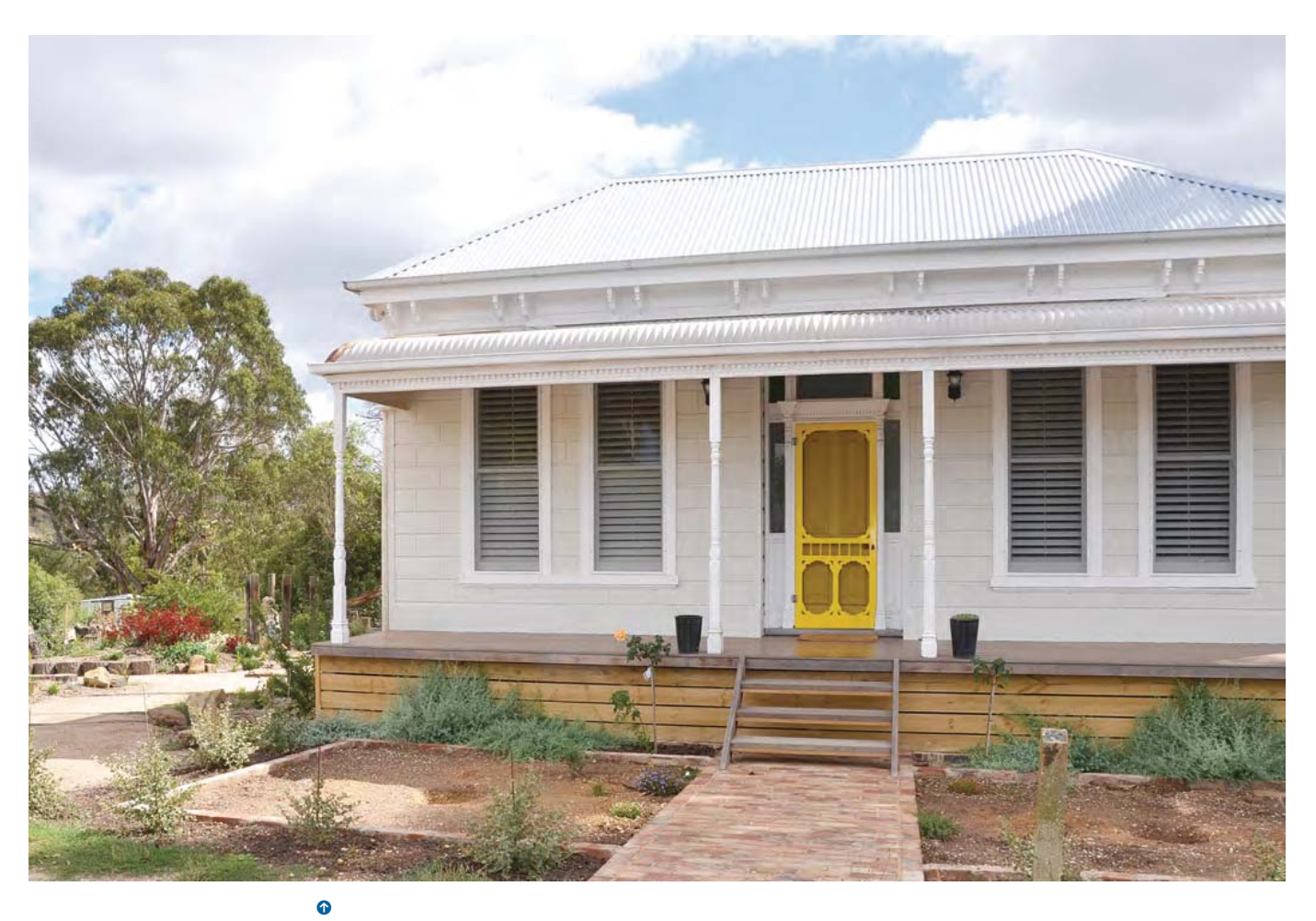
Calan and Sarah reused as many materials as possible in the renovation. Bricks from the original chimneys, which could not be transported with the house were used to make paths around the property.

Originally, the idea of relocating a house was about saving on building costs, but an opportune flow of events quickly gave it momentum. They spotted the characterful house marked for demolition around the corner from where they were living and decided "just to knock on the door," laughs Calan. The sale was agreed soon after, and having already found a north-facing block on a quiet Chewton street overlooking bushland, there was no need to wait.